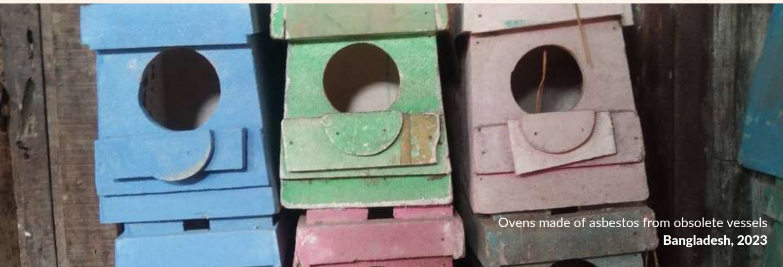
Ovens made of asbestos from obsolete vessels Bangladesh, 2023

In India, it was estimated that nearly 15% of the total workforce involved in shipbreaking practices will suffer from mesothelioma which means about 4,513 mesothelioma deaths among the 31,000 workers estimated have been employed at the yards between 1994 and 2002. In Pakistan, there are no asbestos disposal procedures during dismantling operations and no downstream waste management facilities, and while asbestos is banned from entering Bangladesh, there is no equipment available to help government officials verify the ship owners' or cash buyers' declarations of ' asbestos nil '. Asbestos is often simply resold in the second hand market.