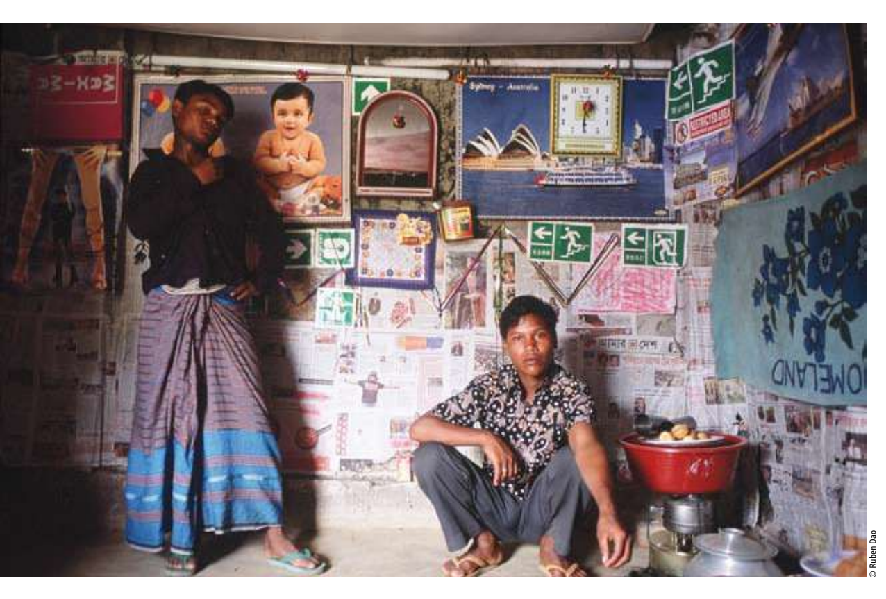
Child workers coming from outside chittagong share basic rooms rented nearby the yards.

fellow workers, we all have nightmare, we talk during our sleep. The cutter whom I share the room with continue to give order during his sleep."